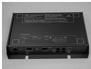
Switch-on multiple Klout amplifiers automatically

A set of normally open relay contacts has